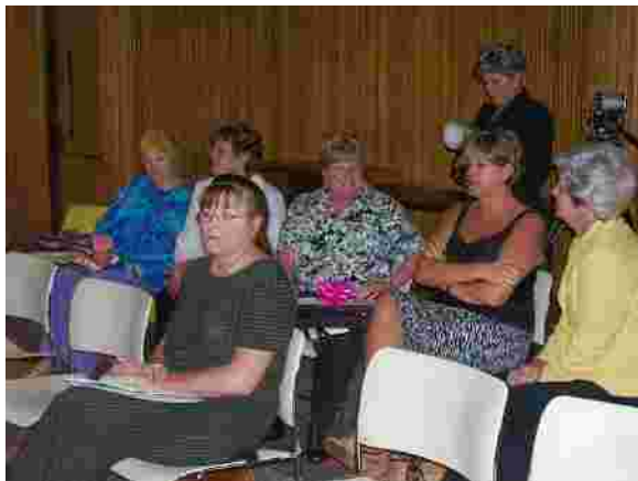
Members enjoying the speaker and installation.